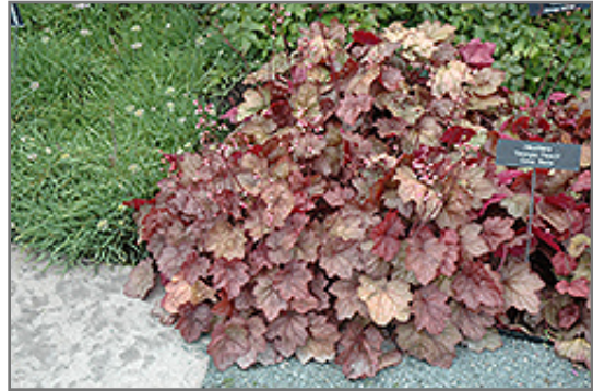
Georgia Peach Coral Bells

Georgia Peach Coral Bells is recommended for the following landscape applications;