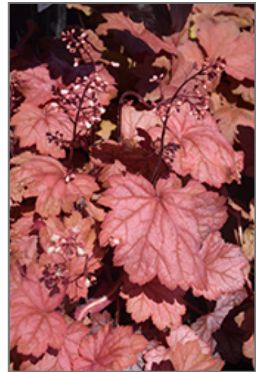
Georgia Peach Coral Bells in bloom