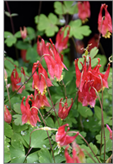
Little Lanterns Columbine flowers

Little Lanterns Columbine is a fine choice for the garden, but it is also a good selection for planting in outdoor pots and containers. It is often used as a 'filler' in the 'spiller-thriller-filler' container combination, providing a mass of flowers and foliage against which the larger thriller plants stand out. Note that when growing plants in outdoor containers and baskets, they may require more frequent waterings than they would in the yard or garden.