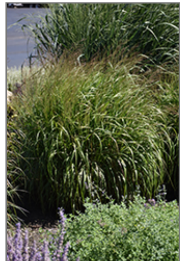
Prairie Winds Apache Rose Switch Grass in bloom