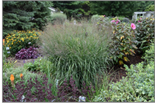
Prairie Winds Apache Rose Switch Grass

This plant does best in full sun to partial shade. It is very adaptable to both dry and moist locations, and should do just fine under typical garden conditions. It is considered to be drought-tolerant, and thus makes an ideal choice for a low-water garden or xeriscape application. It is not particular as to soil type, but has a definite preference for alkaline soils, and is able to handle environmental salt. It is somewhat tolerant of urban pollution. This is a selection of a native North American species. It can be propagated by division; however, as a cultivated variety, be aware that it may be subject to certain restrictions or prohibitions on propagation.