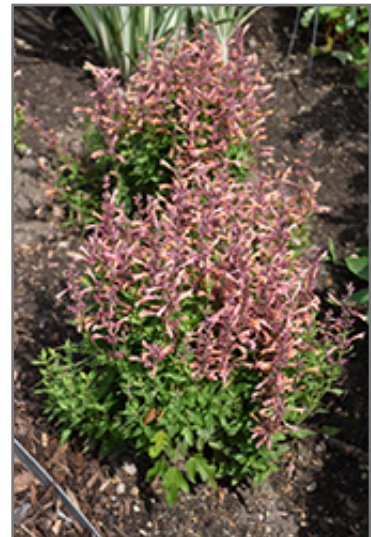
Mango Tango Hyssop in bloom