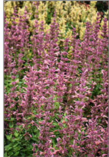
Mango Tango Hyssop flowers

Mango Tango Hyssop is recommended for the following landscape applications;