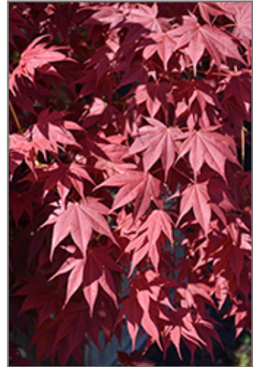
Tsukushi Gata Japanese Maple foliage

This shrub does best in full sun to partial shade. You may want to keep it away from hot, dry locations that receive direct afternoon sun or which get reflected sunlight, such as against the south side of a white wall. It prefers to grow in average to moist conditions, and shouldn't be allowed to dry out. It is not particular as to soil pH, but grows best in rich soils. It is somewhat tolerant of urban pollution. Consider applying a thick mulch around the root zone in winter to protect it in exposed locations or colder microclimates. This is a selected variety of a species not originally from North America.