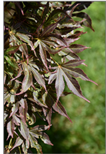
Tsukushi Gata Japanese Maple foliage