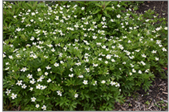
Windflower in bloom

This plant does best in full sun to partial shade. It prefers to grow in average to moist conditions, and shouldn't be allowed to dry out. It is not particular as to soil type or pH. It is somewhat tolerant of urban pollution. This species is not originally from North America. It can be propagated by division.