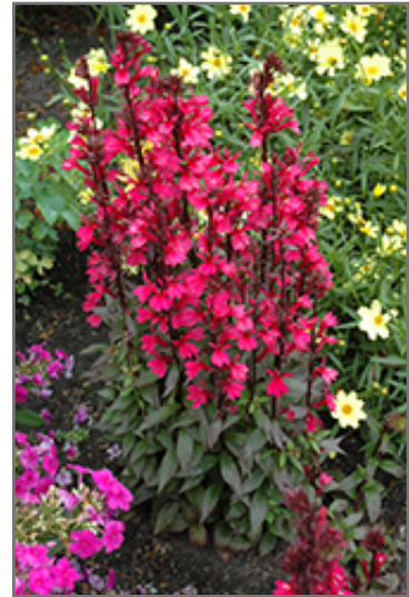
Starship Deep Rose Lobelia in bloom