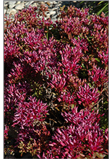
Dragon's Blood Stonecrop in bloom

Dragon's Blood Stonecrop is a fine choice for the garden, but it is also a good selection for planting in outdoor pots and containers. Because of its spreading habit of growth, it is ideally suited for use as a 'spiller' in the 'spiller-thriller-filler' container combination; plant it near the edges where it can spill gracefully over the pot. Note that when growing plants in outdoor containers and baskets, they may require more frequent waterings than they would in the yard or garden.