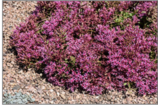
Dragon's Blood Stonecrop flowers

This plant will require occasional maintenance and upkeep, and is best cleaned up in early spring before it resumes active growth for the season. Deer don't particularly care for this plant and will usually leave it alone in favor of tastier treats. Gardeners should be aware of the following characteristic(s) that may warrant special consideration;