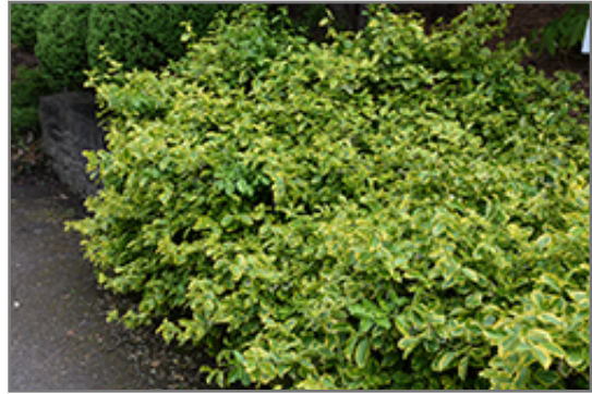
E.T. Gold Wintercreeper

E.T. Gold Wintercreeper is recommended for the following landscape applications;