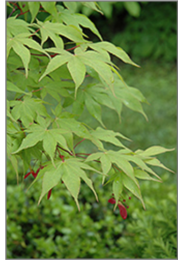
Osakazuki Japanese Maple foliage

This tree does best in full sun to partial shade. You may want to keep it away from hot, dry locations that receive direct afternoon sun or which get reflected sunlight, such as against the south side of a white wall. It prefers to grow in average to moist conditions, and shouldn't be allowed to dry out. It is not particular as to soil pH, but grows best in rich soils. It is somewhat tolerant of urban pollution, and will benefit from being planted in a relatively sheltered location. Consider applying a thick mulch around the root zone in winter to protect it in exposed locations or colder microclimates. This is a selected variety of a species not originally from North America.