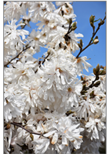
Royal Star Magnolia flowers