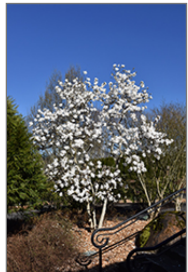
Royal Star Magnolia in bloom