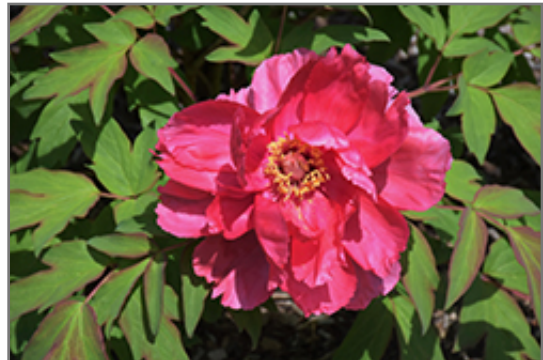
Houki Tree Peony flowers

Houki Tree Peony will grow to be about 5 feet tall at maturity, with a spread of 5 feet. It has a low canopy, and is suitable for planting under power lines. It grows at a slow rate, and under ideal conditions can be expected to live for approximately 20 years.