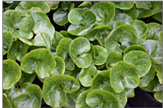
European Wild Ginger foliage