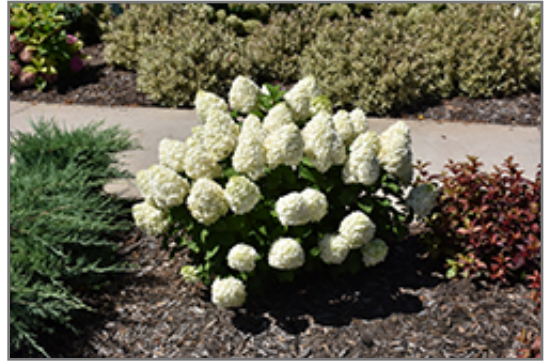
Little Lime Punch Hydrangea in bloom

Little Lime Punch Hydrangea makes a fine choice for the outdoor landscape, but it is also well-suited for use in outdoor pots and containers. With its upright habit of growth, it is best suited for use as a 'thriller' in the 'spiller-thriller-filler' container combination; plant it near the center of the pot, surrounded by smaller plants and those that spill over the edges. It is even sizeable enough that it can be grown alone in a suitable container. Note that when grown in a container, it may not perform exactly as indicated on the tag - this is to be expected. Also note that when growing plants in outdoor containers and baskets, they may require more frequent waterings than they would in the yard or garden.