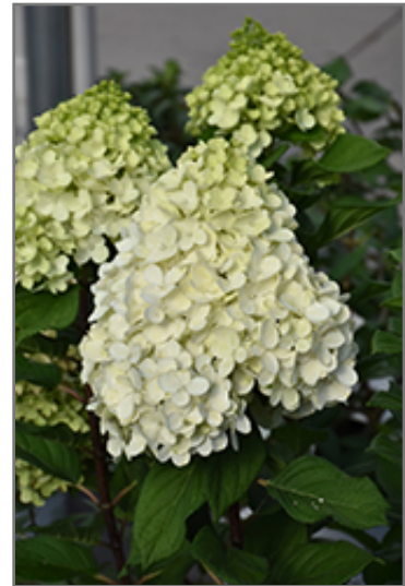
Little Lime Punch Hydrangea flowers