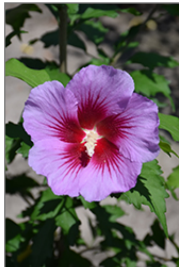
Purple Pillar Rose of Sharon flowers