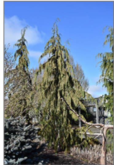
Strict Weeping Nootka Cypress

Strict Weeping Nootka Cypress will grow to be about 25 feet tall at maturity, with a spread of 6 feet. It has a low canopy with a typical clearance of 1 foot from the ground, and is suitable for planting under power lines. It grows at a medium rate, and under ideal conditions can be expected to live for 70 years or more.