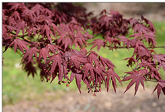
Hefner's Red Select Japanese Maple foliage