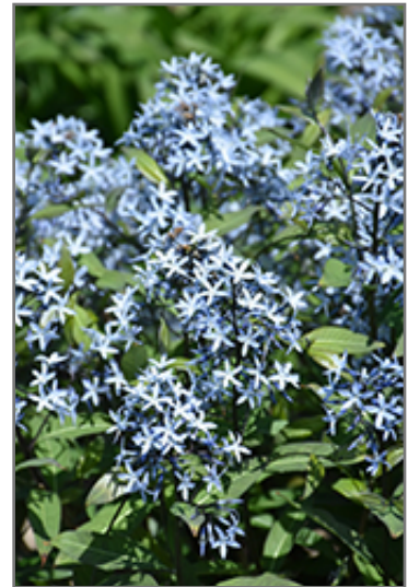
Storm Cloud Bluestar flowers

Storm Cloud Bluestar is recommended for the following landscape applications;