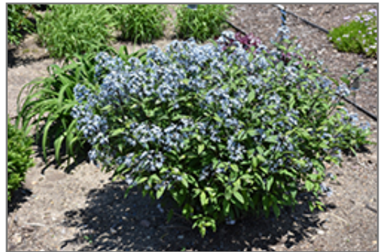
Storm Cloud Bluestar in bloom