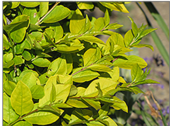
Golden Privet foliage