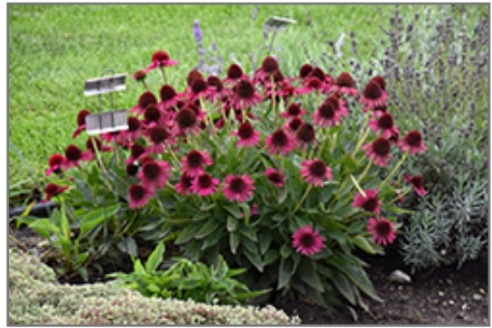
Delicious Candy Coneflower in bloom

Delicious Candy Coneflower will grow to be about 18 inches tall at maturity extending to 24 inches tall with the flowers, with a spread of 15 inches. It grows at a medium rate, and under ideal conditions can be expected to live for approximately 10 years. As an herbaceous perennial, this plant will usually die back to the crown each winter, and will regrow from the base each spring. Be careful not to disturb the crown in late winter when it may not be readily seen!