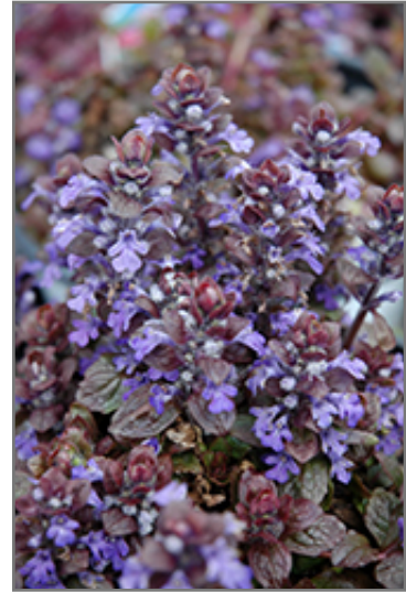
Bronze Beauty Bugleweed flowers

Bronze Beauty Bugleweed is recommended for the following landscape applications;