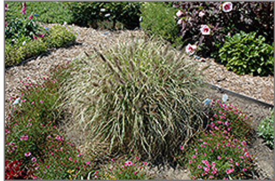
Ginger Love Fountain Grass