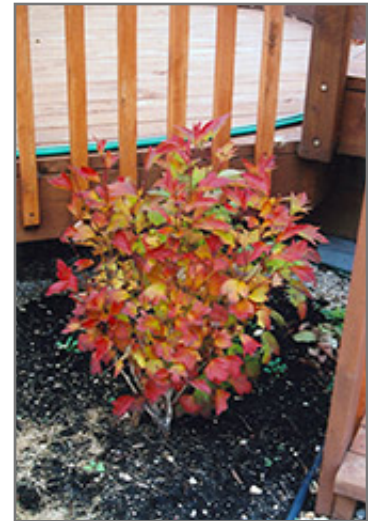
Compact Highbush Cranberry in fall