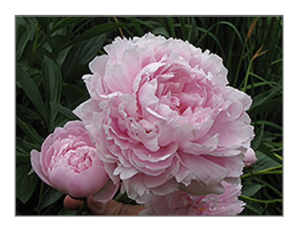
Double Pink Peony flowers

This luxurious peony will create a dramatic late spring display in garden and border plantings; the buds open to reveal stunning, soft pink blooms with slight hints of lavender; the fragrant flowers open on stiff stems making them an excellent cut flower