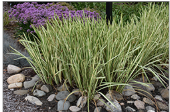
Variegated Sweet Flag