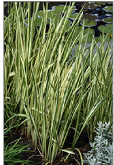
Variegated Sweet Flag