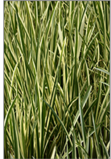
Variegated Sweet Flag foliage

Variegated Sweet Flag is a fine choice for the garden, but it is also a good selection for planting in outdoor pots and containers. With its upright habit of growth, it is best suited for use as a 'thriller' in the 'spiller-thriller-filler' container combination; plant it near the center of the pot, surrounded by smaller plants and those that spill over the edges. It is even sizeable enough that it can be grown alone in a suitable container. Note that when growing plants in outdoor containers and baskets, they may require more frequent waterings than they would in the yard or garden.