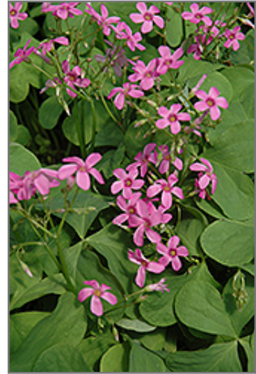
Pink Wood Sorrel flowers