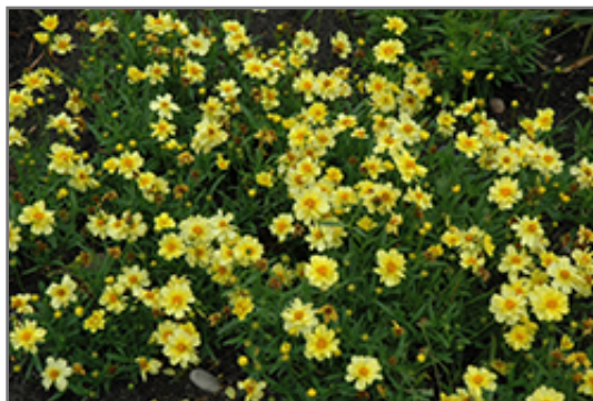
Galaxy Tickseed in bloom