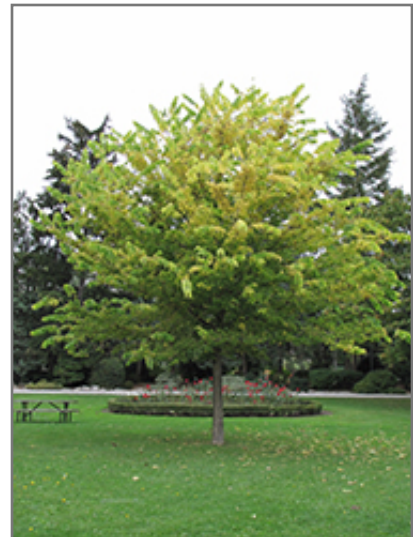
Common Hackberry in fall