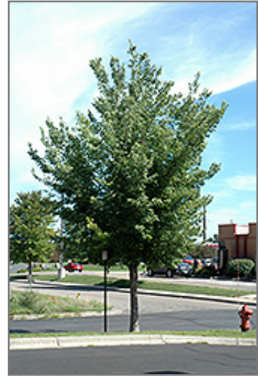
Common Hackberry