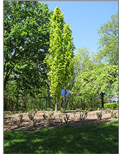
Dawyck Gold Beech