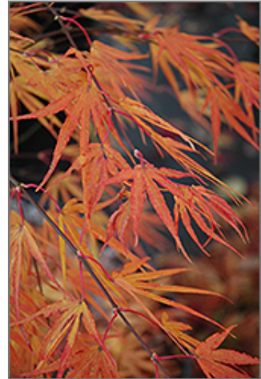
Scolopendrifolium Japanese Maple in fall

Scolopendrifolium Japanese Maple is a fine choice for the yard, but it is also a good selection for planting in outdoor pots and containers. Its large size and upright habit of growth lend it for use as a solitary accent, or in a composition surrounded by smaller plants around the base and those that spill over the edges. It is even sizeable enough that it can be grown alone in a suitable container. Note that when grown in a container, it may not perform exactly as indicated on the tag - this is to be expected. Also note that when growing plants in outdoor containers and baskets, they may require more frequent waterings than they would in the yard or garden.