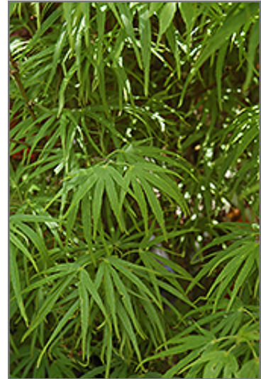
Scolopendrifolium Japanese Maple foliage

Scolopendrifolium Japanese Maple is recommended for the following landscape applications;