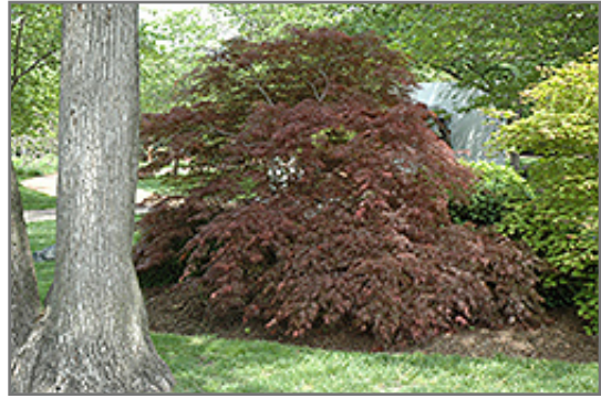
Garnet Cutleaf Japanese Maple

Garnet Cutleaf Japanese Maple will grow to be about 10 feet tall at maturity, with a spread of 8 feet. It has a low canopy with a typical clearance of 1 foot from the ground, and is suitable for planting under power lines. It grows at a fast rate, and under ideal conditions can be expected to live for 60 years or more.