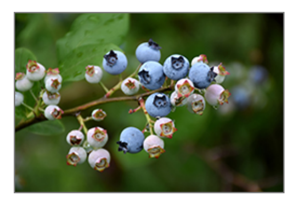
Highbush Blueberry fruit

This is a multi-stemmed deciduous shrub with an upright spreading habit of growth. Its average texture blends into the landscape, but can be balanced by one or two finer or coarser trees or shrubs for an effective composition. This is a relatively low maintenance plant, and usually looks its best without pruning, although it will tolerate pruning. It is a good choice for attracting birds to your yard. It has no significant negative characteristics.