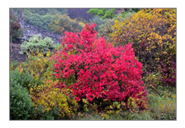
Highbush Blueberry in fall