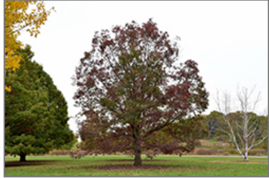
White Oak in fall

This tree should only be grown in full sunlight. It is very adaptable to both dry and moist locations, and should do just fine under average home landscape conditions. It is not particular as to soil type, but has a definite preference for acidic soils. It is highly tolerant of urban pollution and will even thrive in inner city environments. This species is native to parts of North America.