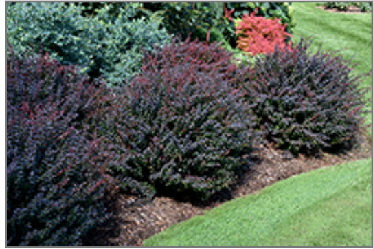
Sunjoy Mini Maroon Japanese Barberry

Sunjoy Mini Maroon Japanese Barberry is recommended for the following landscape applications;