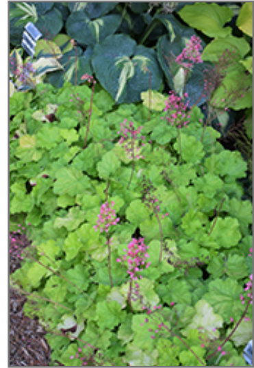
Primo Pretty Pistachio Coral Bells in bloom

This is a relatively low maintenance plant, and should be cut back in late fall in preparation for winter. It is a good choice for attracting butterflies and hummingbirds to your yard. It has no significant negative characteristics.