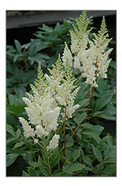
White Gloria Astilbe flowers

This early summer bloomer produces tall stems of creamy white plumes that stand out in shaded gardens, borders or containers; vigorous upright habit with low mounding deep green foliage; easy to grow, requiring little to no maintenance