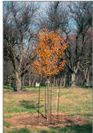
Lancelot Flowering Crab fruit