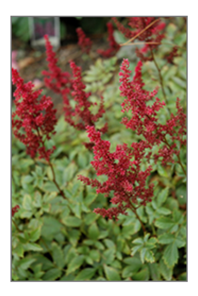
August Light Astilbe flowers

Striking scarlet-red plumes rising above olive-green leaves; foliage is dark red in spring; perfect in a shady spot with dappled light; prefers moisture so water regularly for abundant flowers and nice foliage