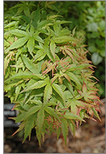
Sharp's Pygmy Japanese Maple foliage