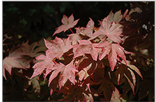
Ruslyn In The Pink Japanese Maple foliage

Ruslyn In The Pink Japanese Maple is recommended for the following landscape applications;