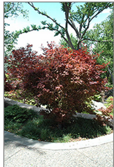
Ruslyn In The Pink Japanese Maple