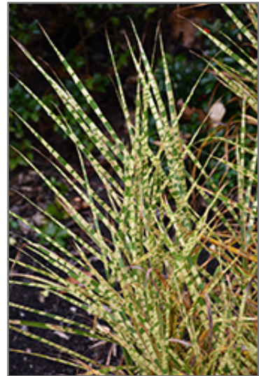
Gold Breeze Maiden Grass foliage