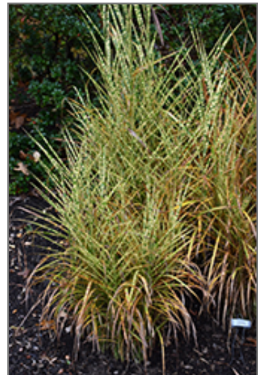
Gold Breeze Maiden Grass